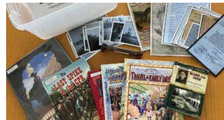
Richmond Public Library presents: History in a Box Workshop Delve into Canadian history using artefacts, primary documents, photographs and more from Richmond Public Library's Learning Kit collection.