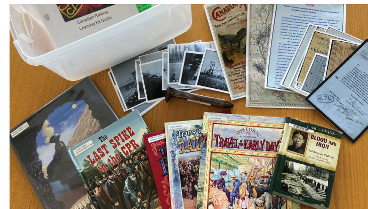
Richmond Public Library presents: History in a Box Workshop

Explore gallery exhibition A Small but Comfy House and Maybe a Dog by artist Amy Ching-Yan Lam. Following the tour, reflect on how cultures are often represented by symbolic animals, and create a series of prints of an iconic animal of your choosing.