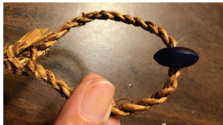
Richmond Arts Centre presents: Friendship Cedar Bracelets Weaving Workshop

Visiting Classes: Teachers can pick up a class set of Canada Activity Passports when they arrive from the Info Station. Visiting students can also take part in any of the drop-in activities on the Outdoor Plaza.