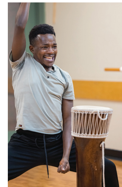
Richmond Arts Centre presents: Drumming and Movement Workshop

Delve into Canadian history using artefacts, primary documents, photographs and more from Richmond Public Library's Learning Kit collection.